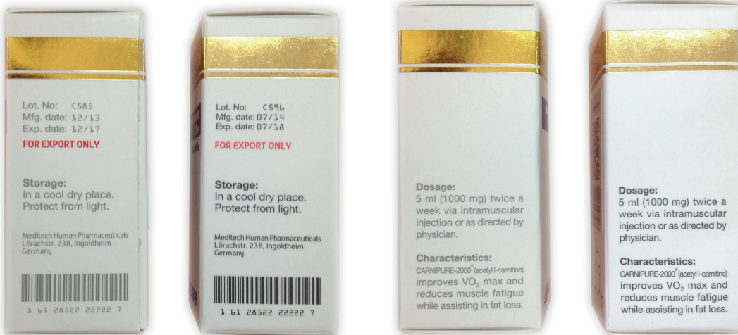
Left: Old package Right: New package