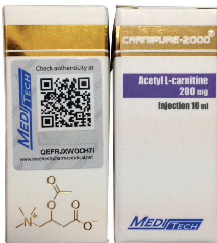
Final package (have Authenticity)