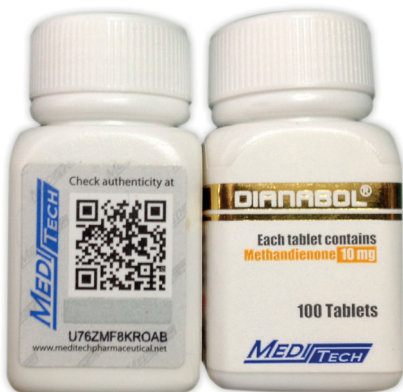
Final package (have Authenticity)