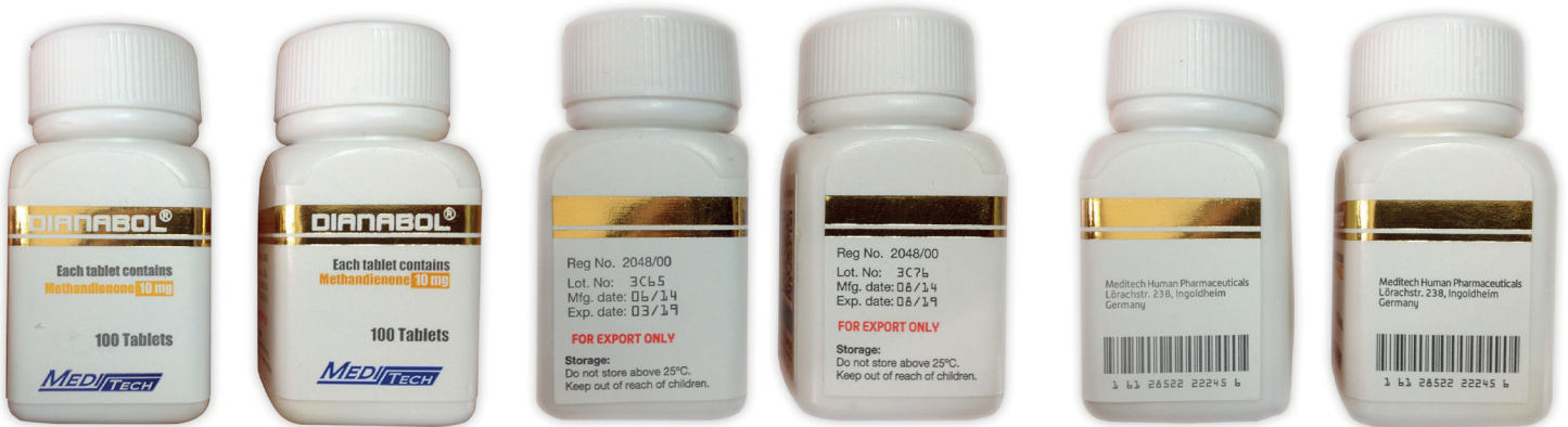
Left: Old package / Right: New package

2. Product information text on the label changes from light grey to black.