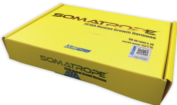
Final Package ( have Hologram and Authenticity)